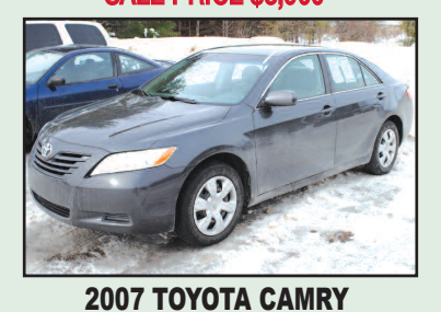
Loaded, 107 K. $189 OR LESS