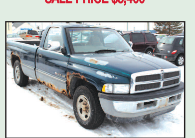
1994 RAM 1500 LARAMIE SLT V-8, runs good, auto. SALE PRICE $995