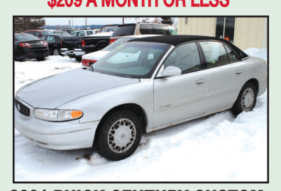
Cloth roof, pwr. everything, steering wheel controls. SALE PRICE $3,900