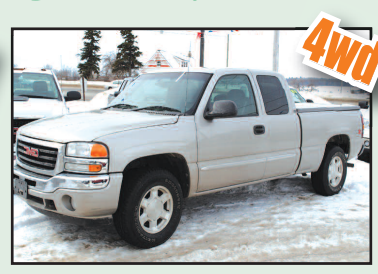
2006 GMC SLE 1/2 TON PICKUP 4x4, Loaded, fiberglass bed cover, bedliner, tow pkg, seats 5. $209 A MONTH OR LESS