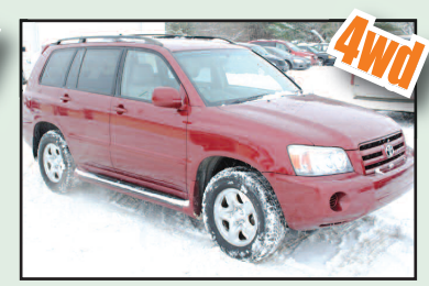
2005 TOYOTA HIGHLANDER 4WD, tow pkg. Lots of cargo room. Only 103k miles. SALE PRICE $10,497