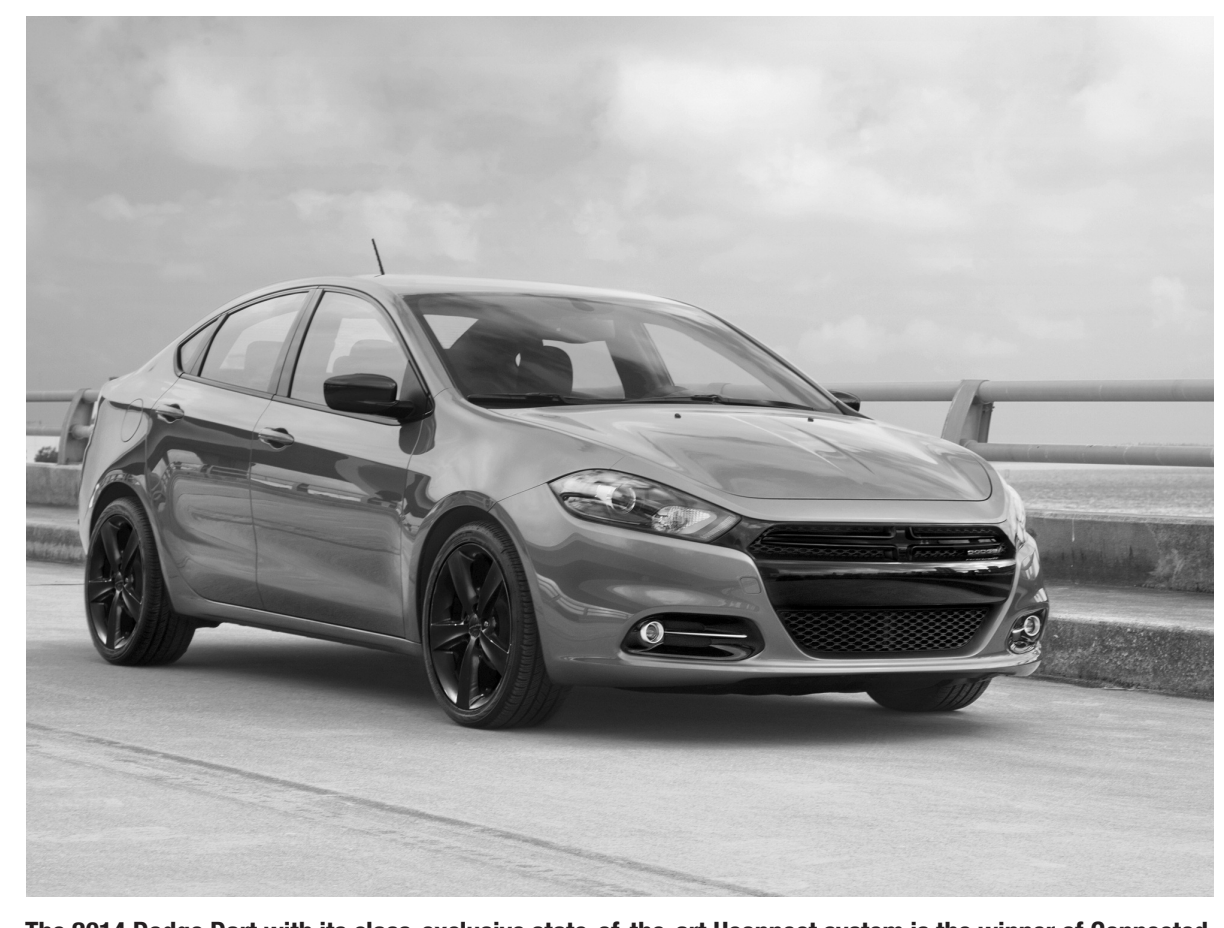
The 2014 Dodge Dart with its class-exclusive state-of-the-art Uconnect system is the winner of Connected World magazine's 2014 Connected Car of the Year Award.