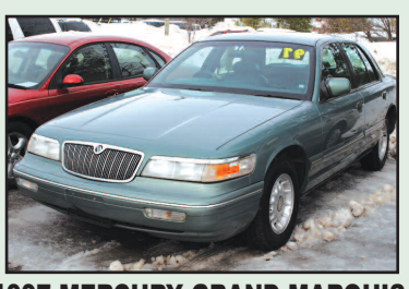
1997 MERCURY GRAND MARQUIS Leather and loaded. SALE PRICE $1,995