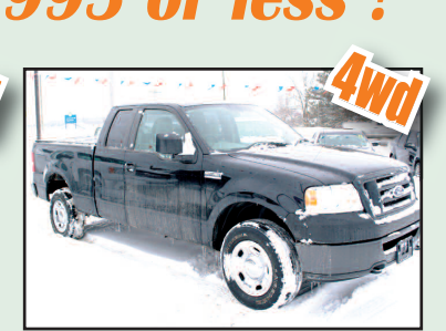
2008 FORD F-150 XL 4x4, soft tonneau bed cover, tow pkg, bedliner, ext cab, seats 5. Only 84 K. SALE PRICE $14,997