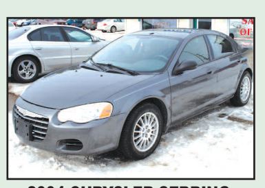
2004 CHRYSLER SEBRING SALE PRICE $3,995